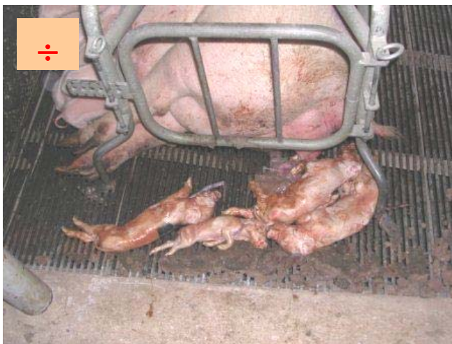
Failure to detect a bad farrowing course