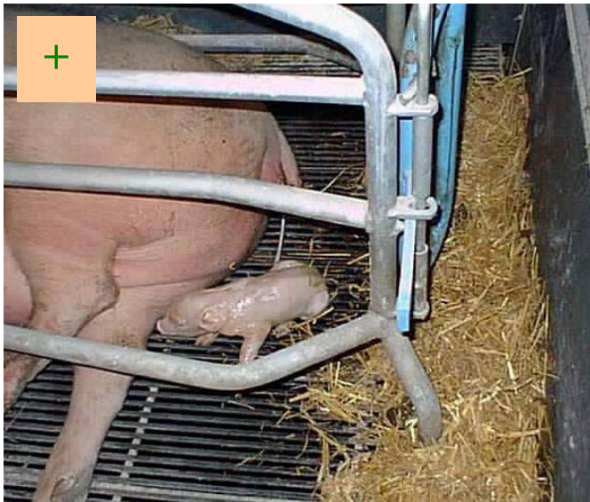
Newborn piglet found in due time